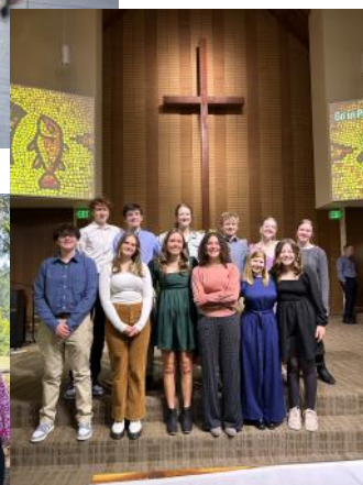
Confirmation class 2023