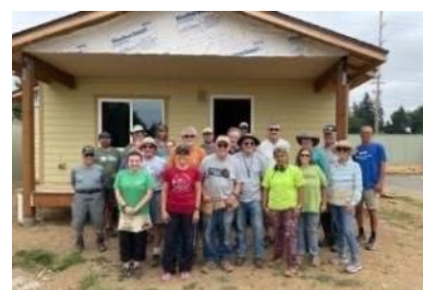
Habitat for Humanity Build Team