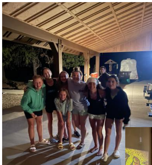
Square Dance Crew at Bike Hike

Youth Ministries at CPC encompasses a lot of areas of the church life. The majority of the program focuses on sixth through twelfth graders, but we also work with the Young Adults at Columbia. In 2023, as a Youth Team, we saw a good amount of growth within the size of our weekly programs and retreats. Along with having more students to have relationships with, we also saw a lot of spiritual growth within our students. Through specific Sunday School classes like Confirmation, students have had space to ask questions about their faith and to think critically about their choice to follow Christ. This is the continuing goal of Youth Ministry at CPC; that students continue to ask questions and learn about our loving God.