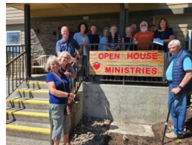
Open House Ministries Tour