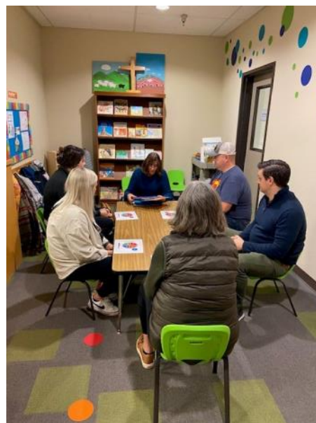
Circle of Friends nutrition classes for family members of the Two-ty pop class students.