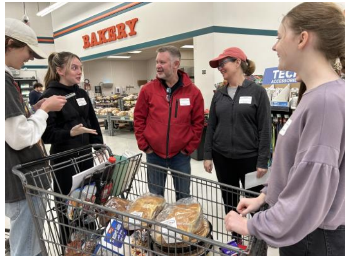
Thanksgiving Food Basket Shopping