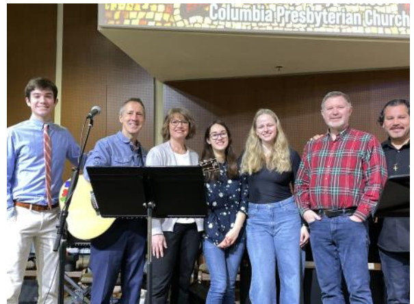
Contemporary Worship Team