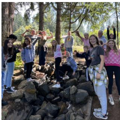
Finding crawdads at Back to School Retreat