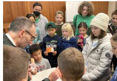
Hands-on object lesson

K 2 Live is Columbia's mid-week program for children in third, fourth, and fifth grades. Each Wednesday, twenty-five to thirty kids meet to experience God through large group activities and Bible teaching, small group discussion, gym games, craft projects, mission experiences, and trust and community-building games. Families are included in events four times during the year in an effort to include and encourage them as the primary faith educators of their children.