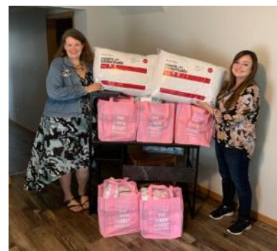
The Linen Closet