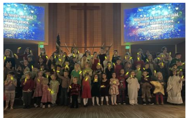
Christmas Eve Children's Service