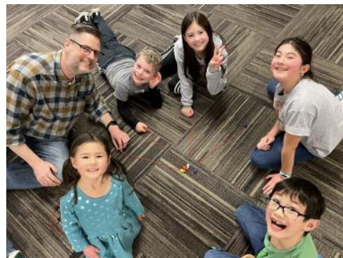
Family Game Night