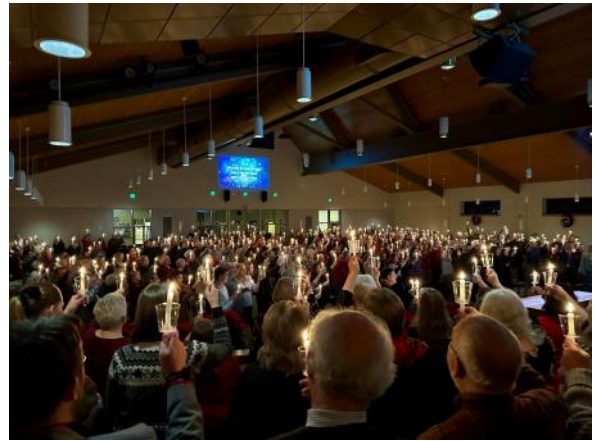
View from the front of the sanctuary on Christmas Eve

There are well over one hundred individuals who participate as leaders in the worship area. This includes musicians, sound, video, and livestream volunteers, ministers, lay leaders, ushers, greeters, flower arrangers, decorators, artists, singers, and the list goes on. Our goal is to give God all the honor, glory, and praise while we provide a place for our community to worship Him. To God be the glory.