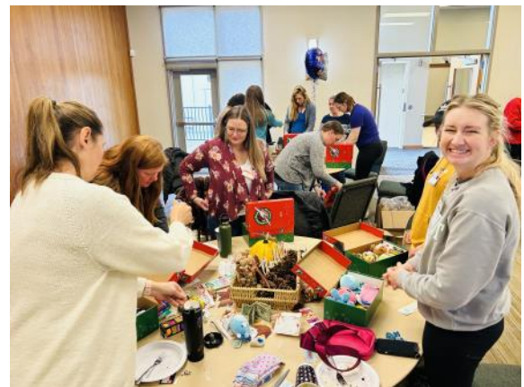
MOPS group filling shoe boxes for Operation Christmas Child