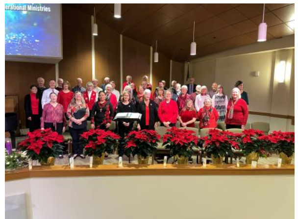
Adult Choir at the Christmas Concert