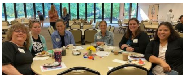
Teachers attending an Early Learning Conference

Circle of Friends has been a ministry of Columbia Presbyterian Church for 30 years. It is a separate non-profit with its own board. Many young families are introduced to Columbia through COF, and that has been enhanced this year with a stronger relationship with Children's Ministries.